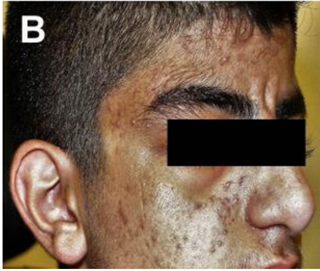
Figure 2 Facial examination disclosed deep furrowing of the forehead (A) prominently visible on ¾ profile of the face (B) as well as oily skin with folliculitis particularly on the forehead and cheeks.