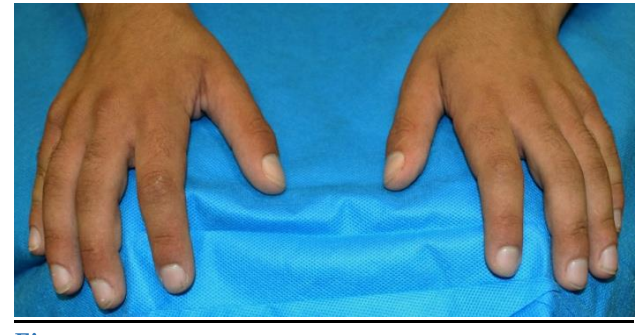
Figure 3 Prominent clubbing of fingernails is present.