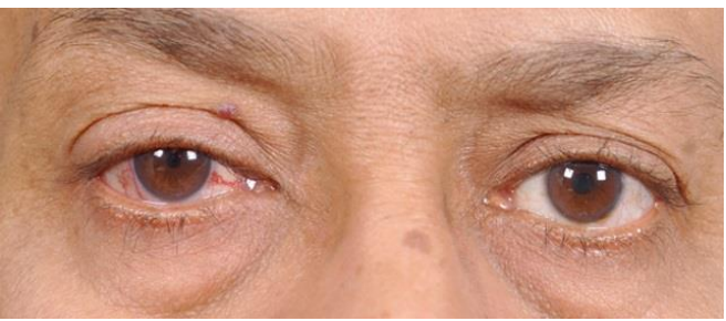
Figure 1 Axial proptosis of the right side was present.

Best corrected visual acuity was 20/40 in the right eye and 20/20 in the left eye. On clinical examination, extraocular movements were full, orthophoric, and painless in all directions of gaze. A right-sided subtle axial proptosis was present (Figure 1). Anterior