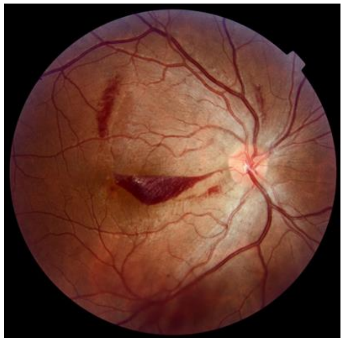
Figure 2 One week after the laser hyaloidotomy, a small amount of preretinal hemorrhage remains in front of the macula. There is also dispersed vitreous hemorrhage inferiorly.