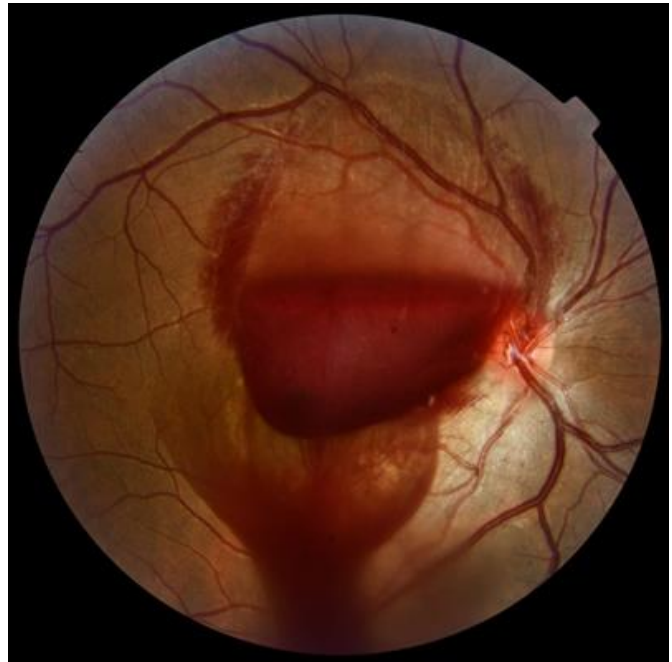
Figure 1 Drainage of preretinal hemorrhage into the vitreous cavity is seen in the right eye within moments following the Nd-YAG laser hyaloidotomy.

Patients with Valsalva retinopathy often give a history of recent heavy lifting, straining, vomiting, coughing, or the labor of childbirth. 3,4 With rupture of a retinal capillary or capillaries following the increased venous pressure, intraretinal, preretinal, and vitreous hemorrhages may occur. In younger patients with an intact posterior hyaloid, the preretinal hemorrhage becomes encapsulated in the