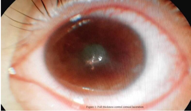
Figure 1 Photograph of the full thickness central linear corneal laceration of the left eye.